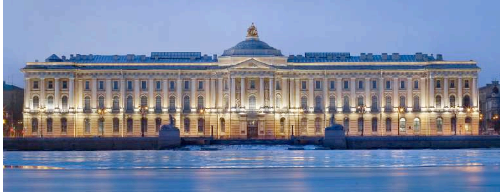
The Imperial Museum of Fine Arts, St. Petersburg, Russia