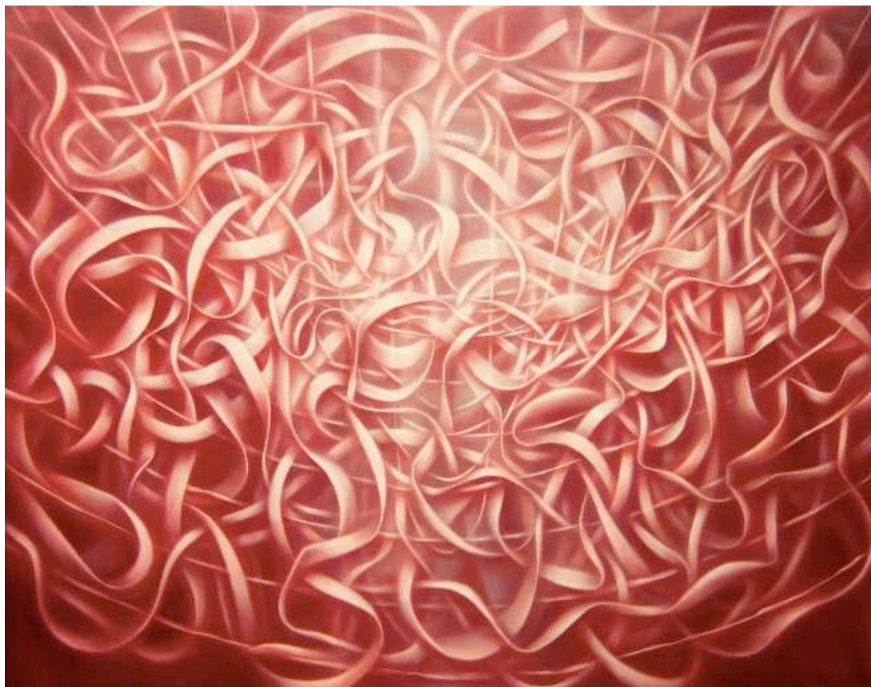
Shane Guffogg, 2015, The Observer is the Observed , oil on canvas, h: 84" x w: 108"

“The Observer is the Observed” traveling exhibition