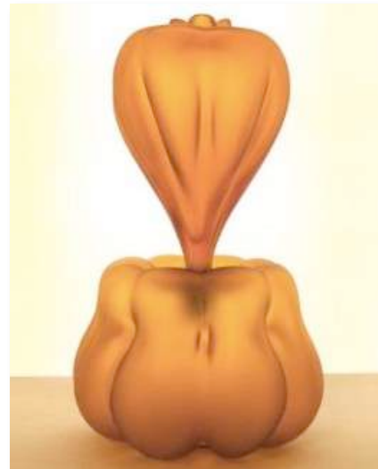
Shane Guffogg, 2014, The Fifth Sound , amber color, Murano blown glass, sanded, 3 +1 AP, h: 19" x w: 12" x d: 12"