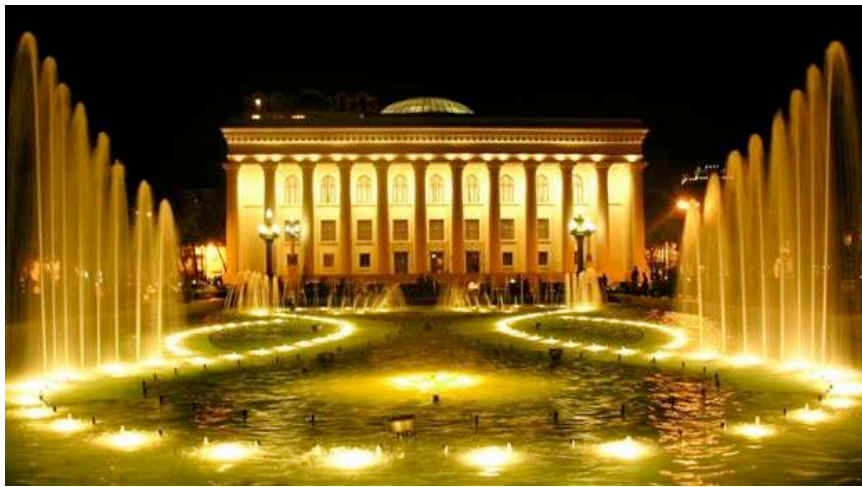
The Gallery of the Museum Center, Baku, Azerbaijan